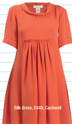
Silk dress, £440, Cacharel

The couple behind this boutique have channelled their extensive fashion expertise into selecting pieces for women who want to shop for chic European designers. Includes Cacharel, By Malene Birger and fresh label Designers Remix.